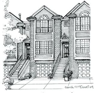
2425 NW Lovejoy $790,000.