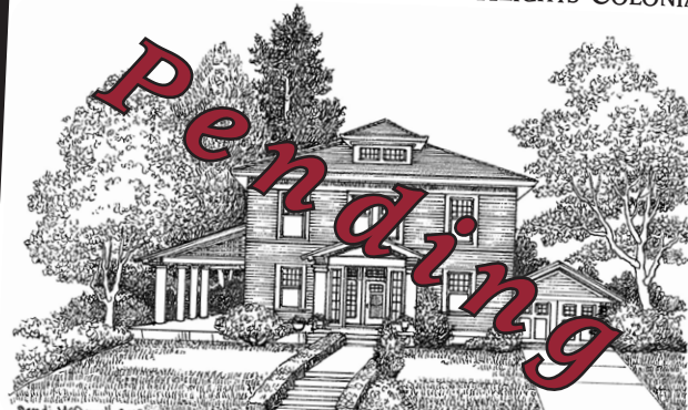
1820 NW 32nd Avenue

HOT SPICED CIDER AND CONVERSATION IN THE INGLENOOK EMIL SCHACHT 1902 WILLAMETTE HEIGHTS COLONIAL