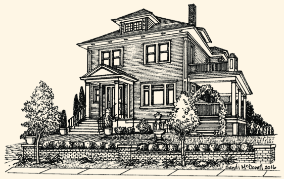
Schuyler Home 1908