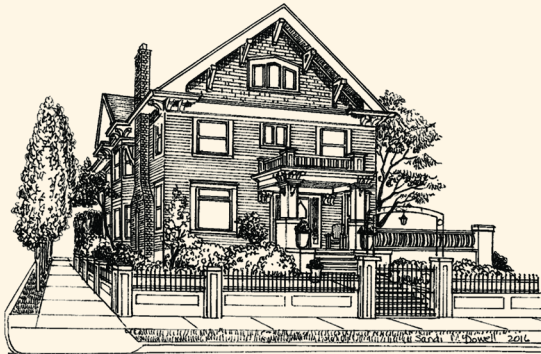
Margaret Lutke Home 1908