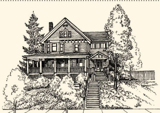
Hodson Home 1901