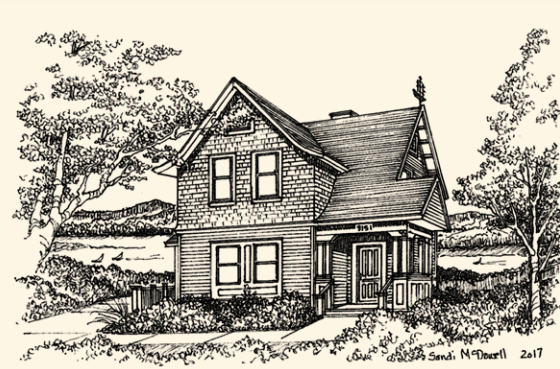
Jennings Home 1888