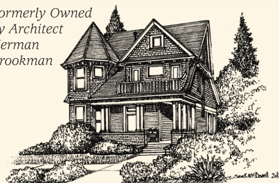
Tucker Home 1894

Formerly Owned by Architect Herman Brookman